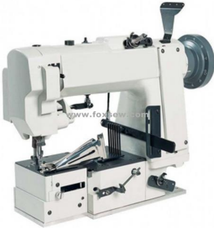
Table Top Tape Edge Sewing Machine

E-mail: sales@foxsew.com Website: www.foxsew.com