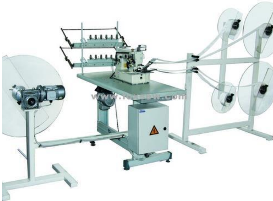
Mattress Handle Strap Quilting and Cutting Machine

E-mail: sales@foxsew.com Website: www.foxsew.com